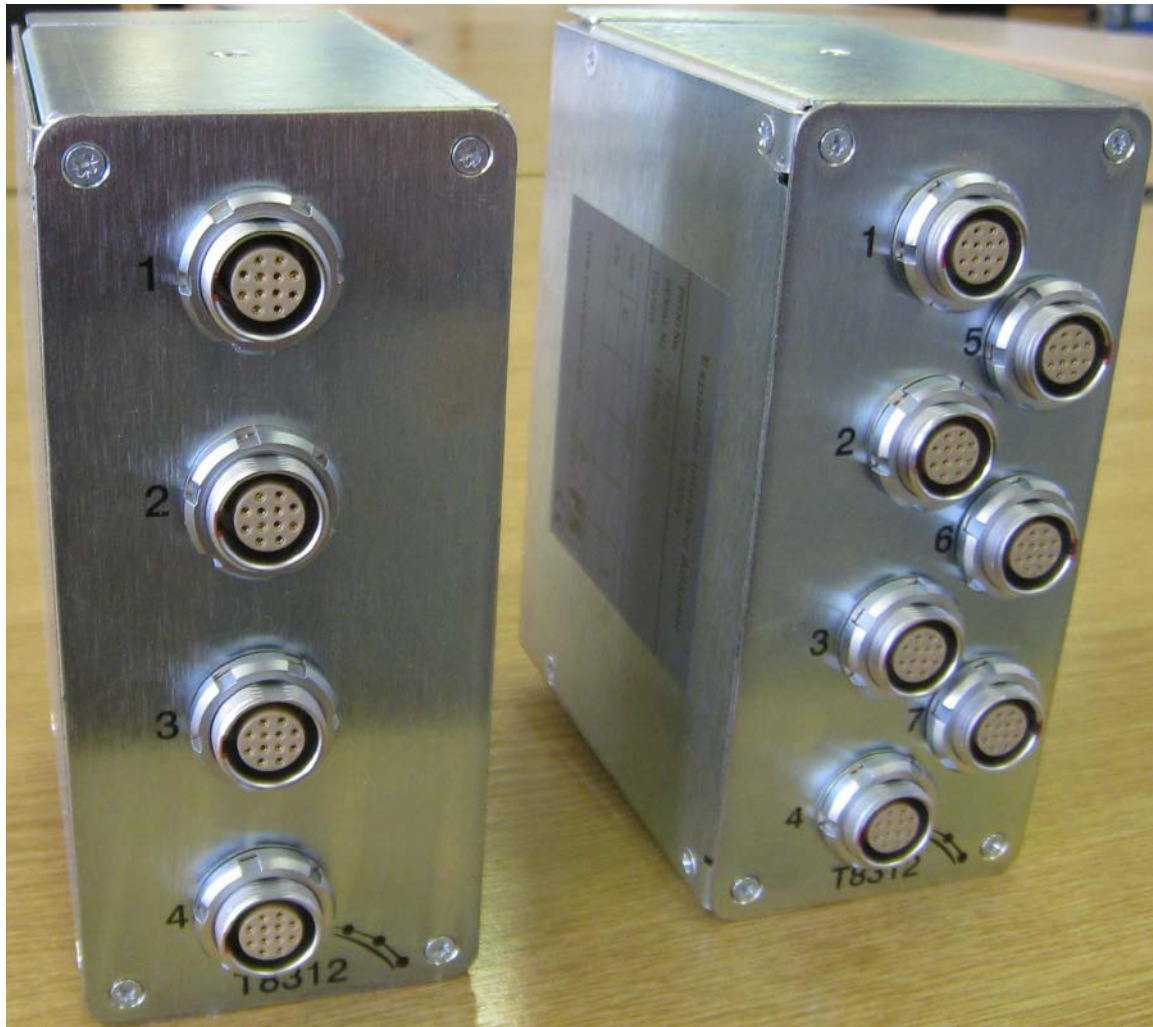
Figure 1 T8312 Photo

The Trusted Expander Interface Adapter Unit T8312 comprises four, or seven 12-pin ODU connectors (dependent on type of Unit), a printed circuit board (PCB), a 96-way C type connector which plugs into a double 96-way connector assembly designed to be connected to the Trusted Expander Interface Modules resident in the Controller Chassis. The Unit is contained within a metal enclosure and is designed to be clipped onto the Controller Chassis rear connectors. A release button is provided to enable the Unit to be disconnected.